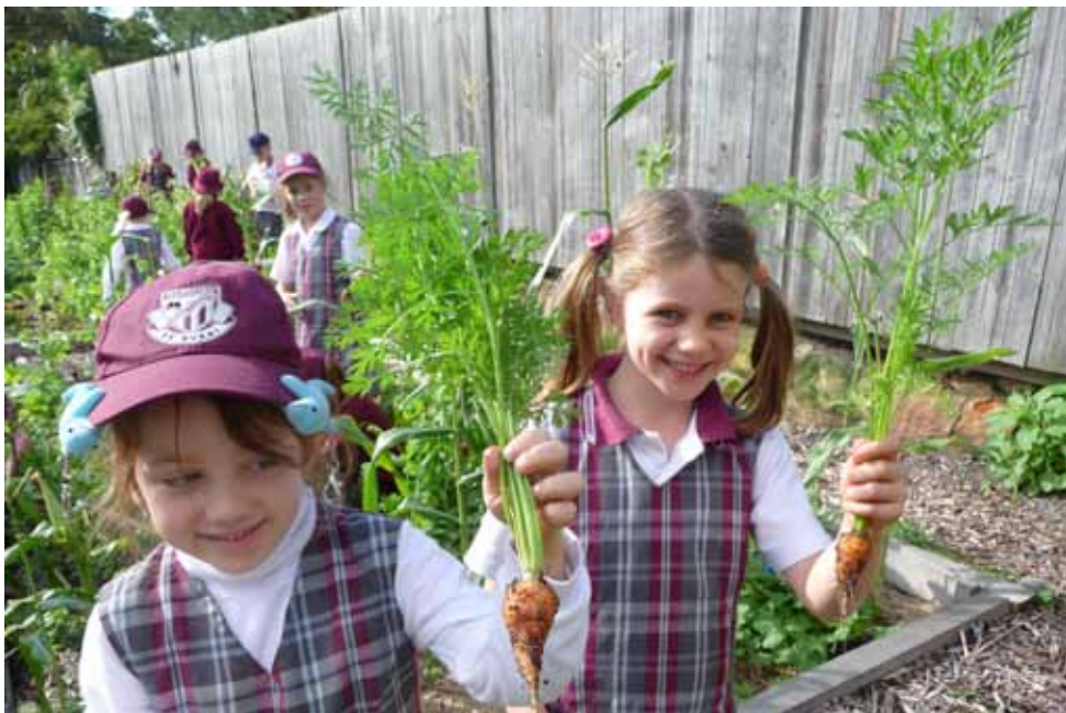
Garden Gurus admiring the art of growing carrots