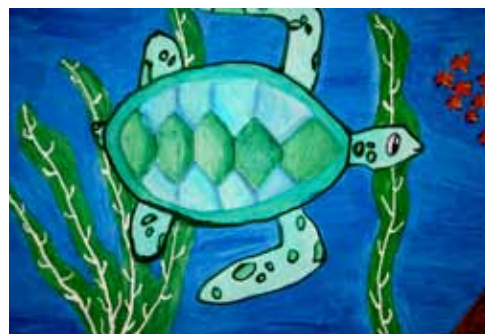
Turtle, Artist Age 9

To find out more information or to book a place in the workshops, contact Daphne on 0409 569483 or daphne.katos@bigpond.com .