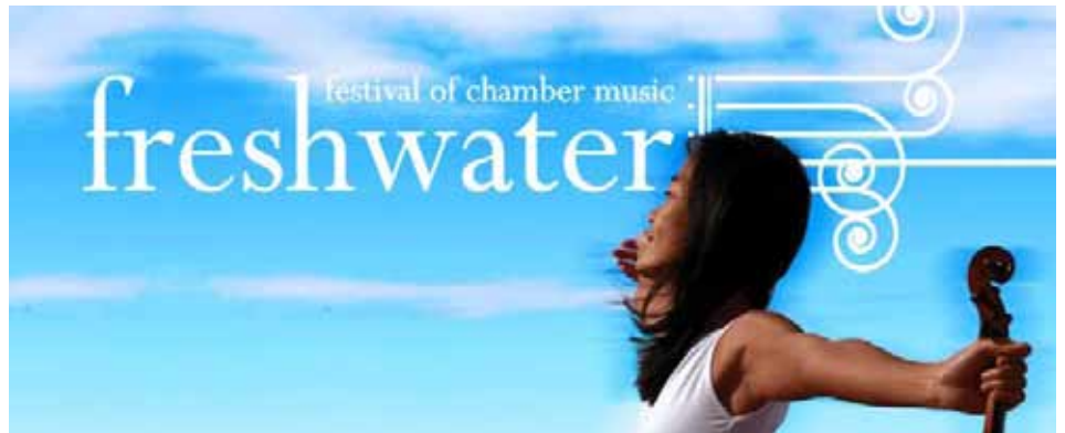
Freshwater Festival, October Long Weekend, 2010

Monday will also feature a chamber music competition for ensembles drawn from secondary schools along the Peninsula. The competition, The Officeworks Dee Why Chamber Music Competition, carries prize money of $1,000 plus a splendid perpetual trophy. The school ensembles will