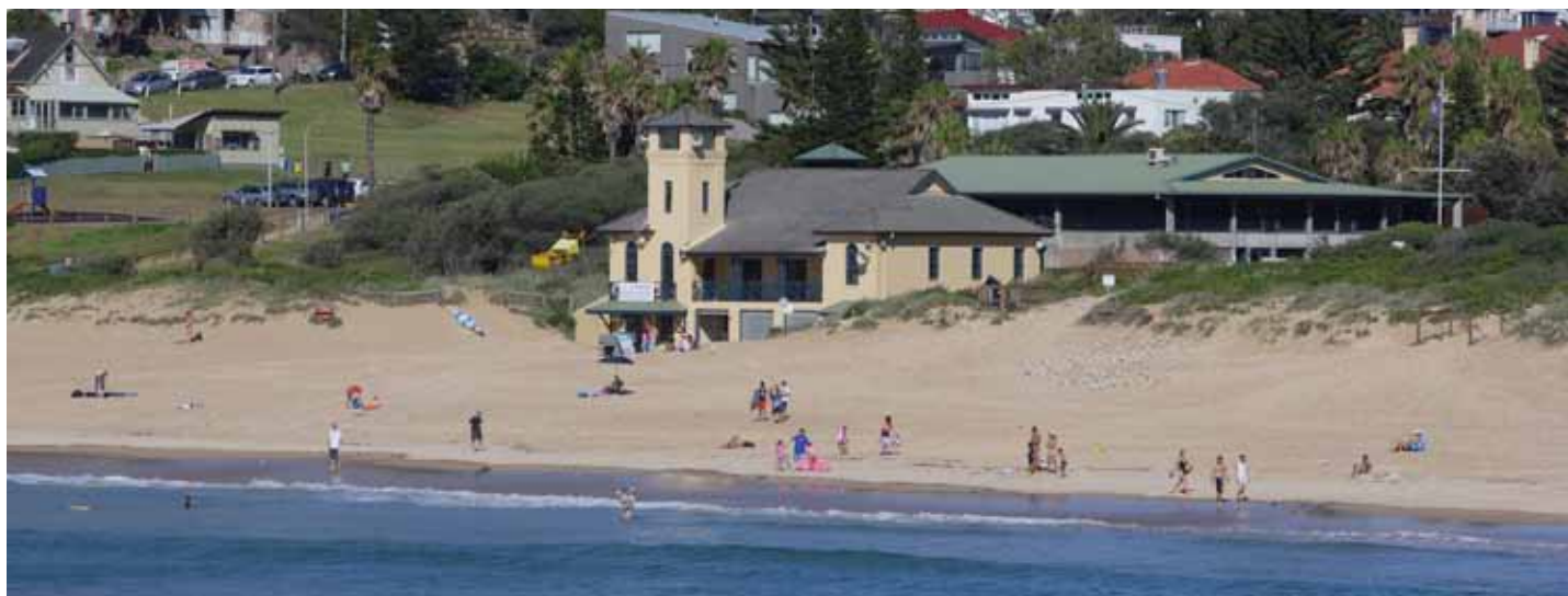
Freshwater Beach, the natural landmark for which we are named after

Harbord Community Bank ® Branch of Bendigo Bank would like to announce our change of branch name to reflect the suburb we live in.