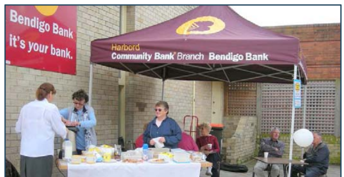
The ladies from St Peter's Uniting Church display their yummy cakes

Thank you to everyone involved in Australia's Biggest Morning Tea in Freshwater. From our driveway site, the lure of hot cuppas and cakes enticed passers-by to give generously to the Cancer Foundation. We raised much needed funds to support cancer research.