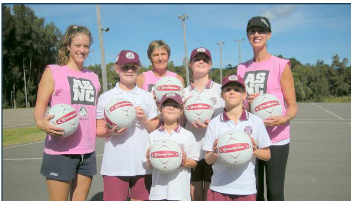
Anne Sargeant Netball Clinic with Harbord School Students

Anne Sargeant, former Captain of the Australian Netball Team, and two other pro players coached the girls. Their skills have been played out against other public schools in Friday afternoon sport.